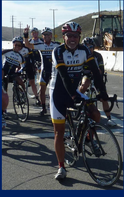
Laguna Canyon taken 09:35am, Oct. 24th 2010